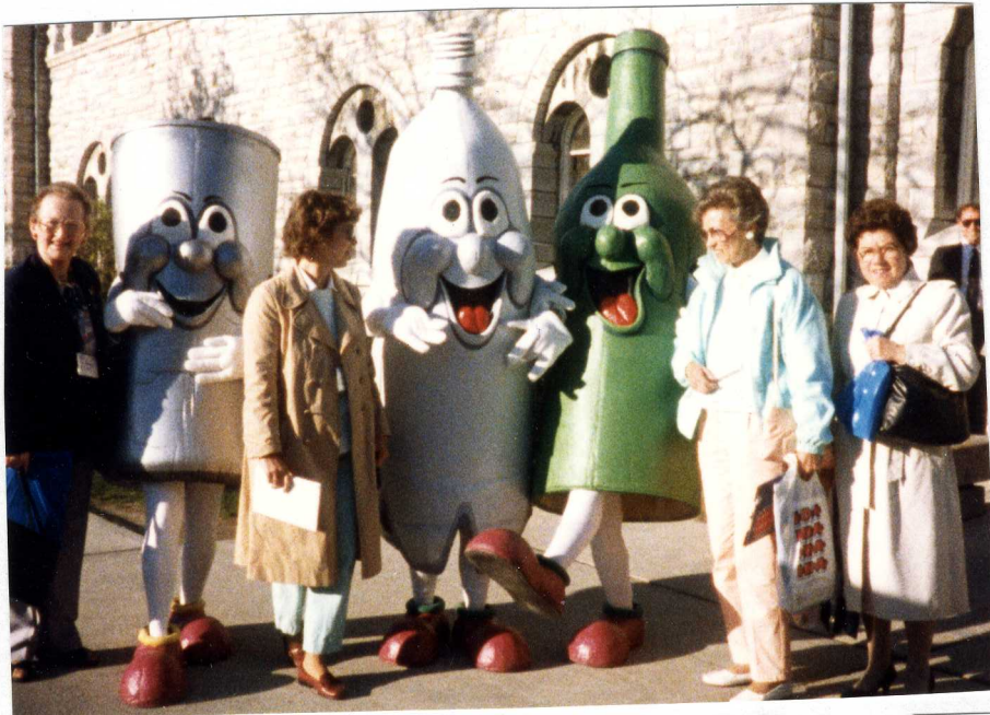
Recycling Puppets from O.W.M.A.