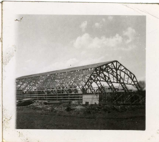
The old Arena demolished in 1976