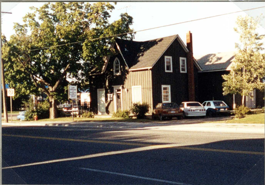
Hwy 27 west east side