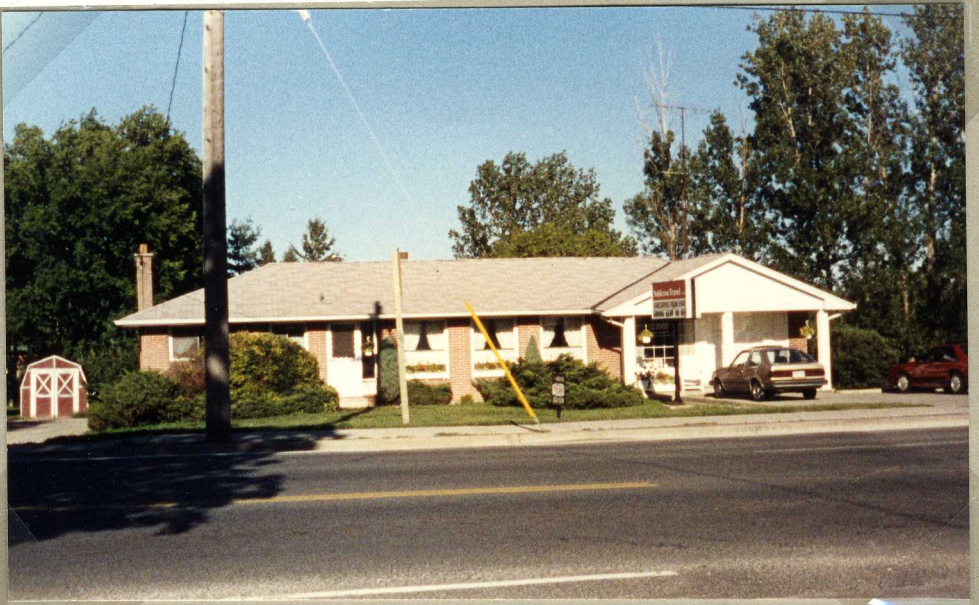
NOBLETON TRAVEL 1991