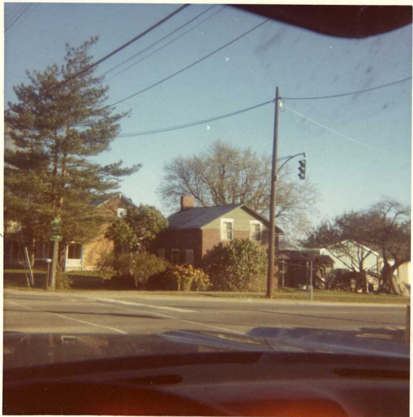
Kaake House and The Cherry House (70's)