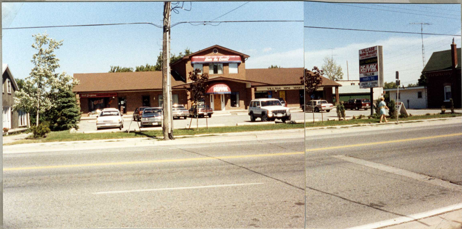
Mini Mart Plaza (1991) Hwy 27 East Side North of King Rd