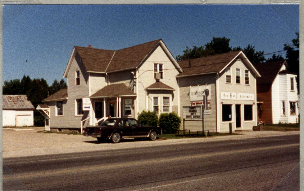
Hwy 27 west side