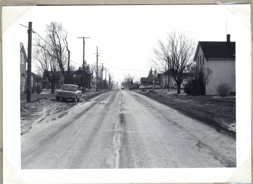
Highway 27 south standing just north of the King Rd.