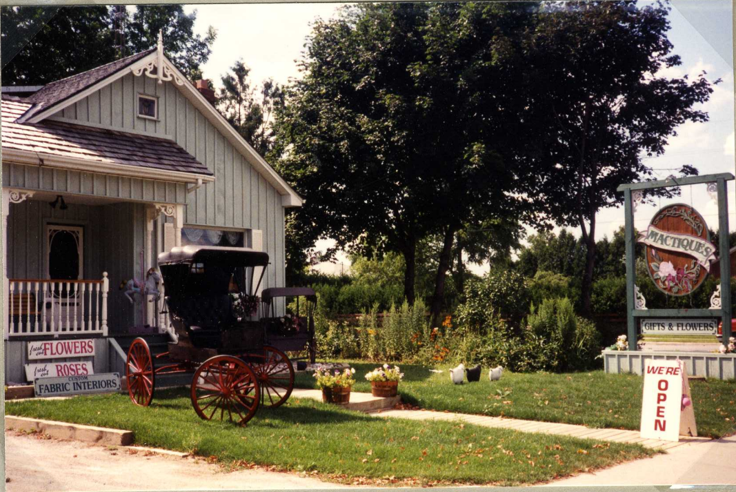
MACTIQUES GIFTS AND FLOWERS corner of Hy 27 and Wilson