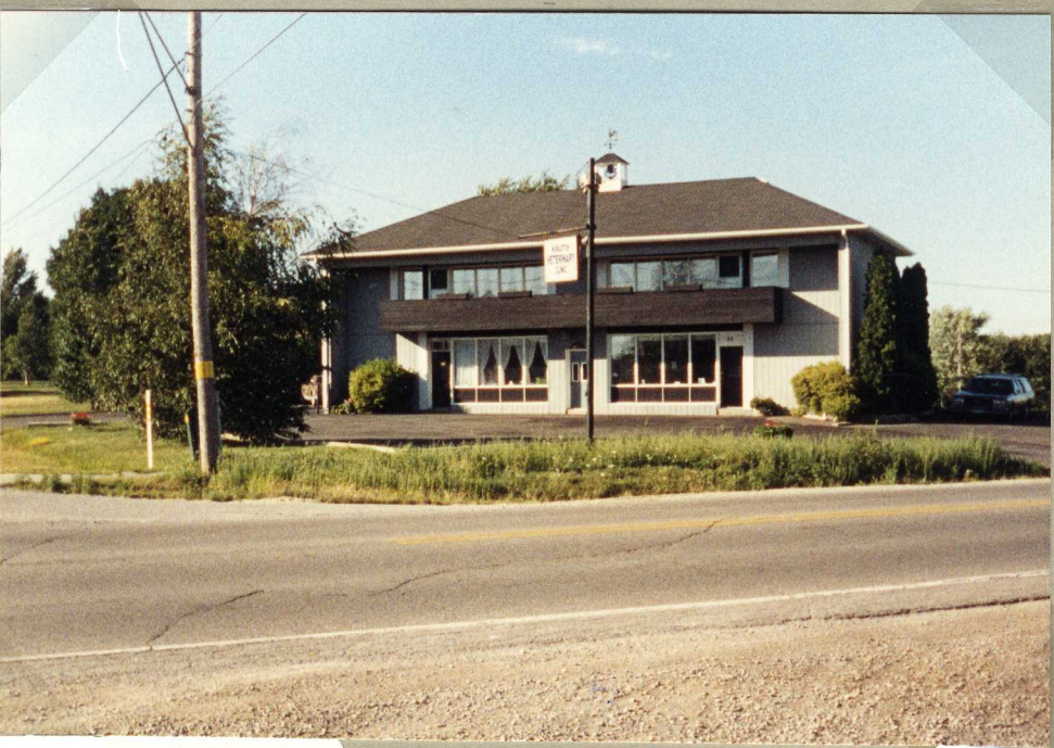
Left Real Estate Office Right Nobleton Veterinary Office