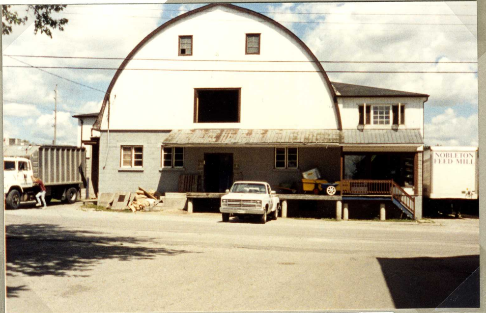
NOBLETON FEED MILL