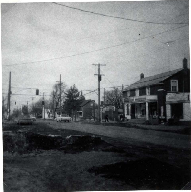
South East corner Left Kaake's Store Right now the Towerburger