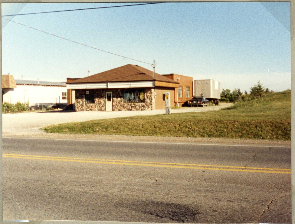
now it is DiFebo's