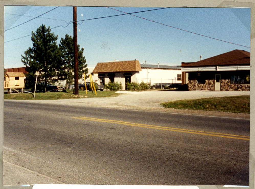
as it looks now 1991