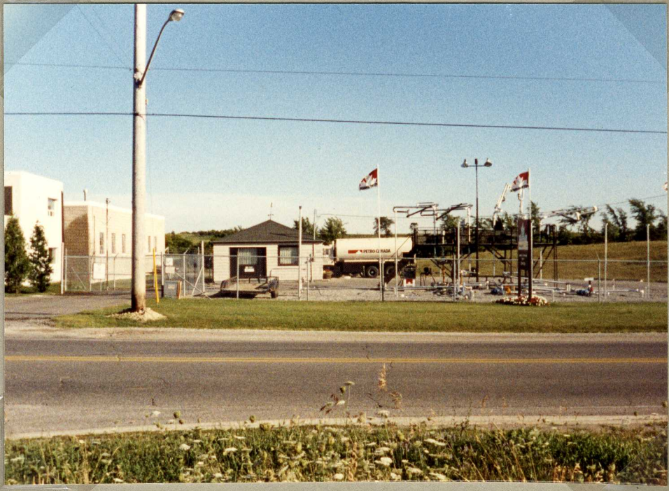
Left some new stores on King Rd. E. Right Petro-Canada supply Depot