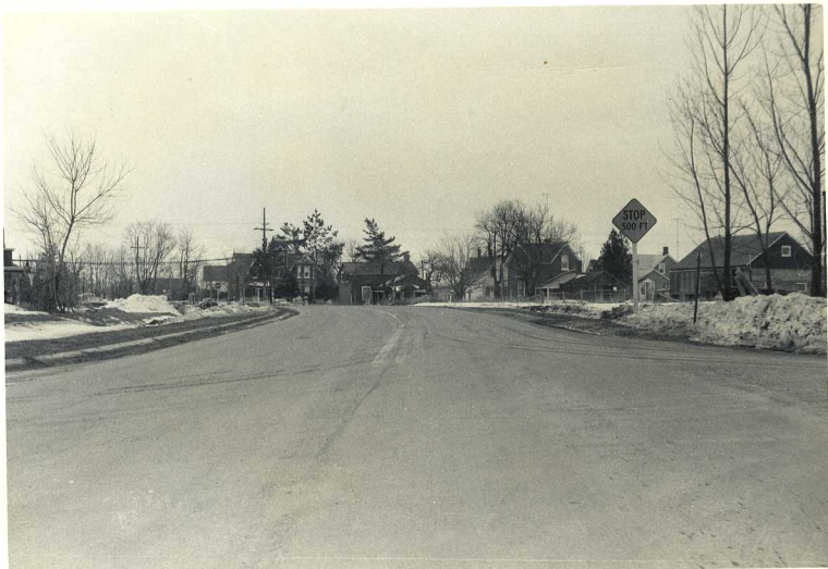
King Road at the turn of to the mill looking west