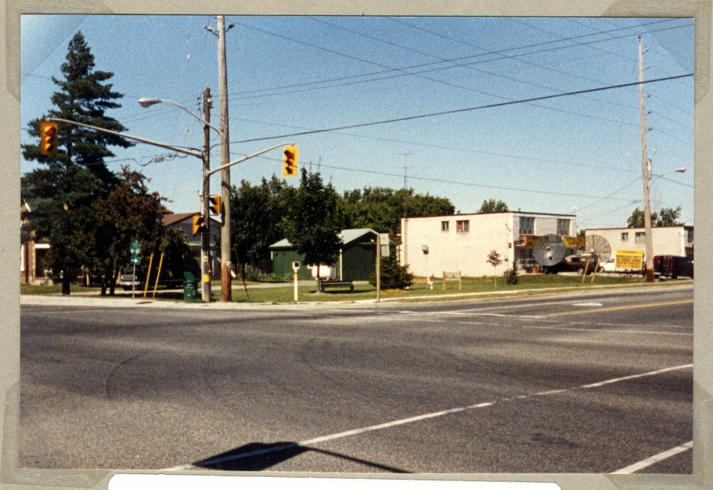
CHERRY PARK house torn down when road was made