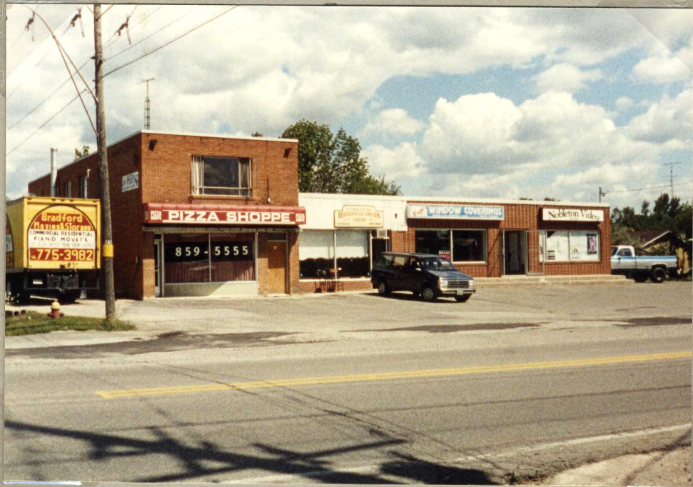
Left Home Hardware store Right Pizza Shop and three new stores