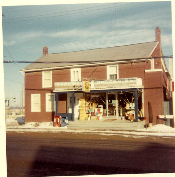
←-----1894 to 1949