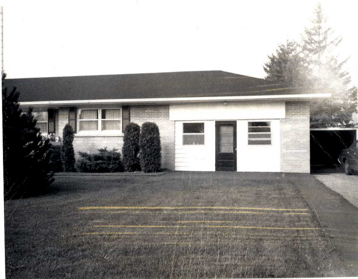
1962 to 1969