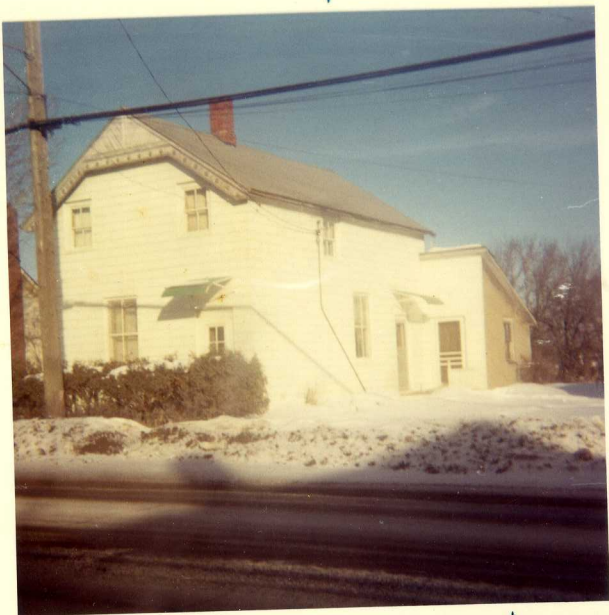
←----- Nobleton Post Office until 1870