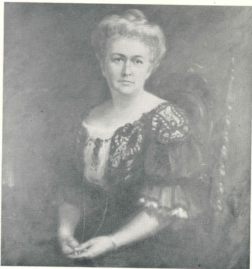
Mrs. Adelaide Hoodless founder of The Women's Institute.