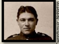
Tweedsmuir - Nobleton