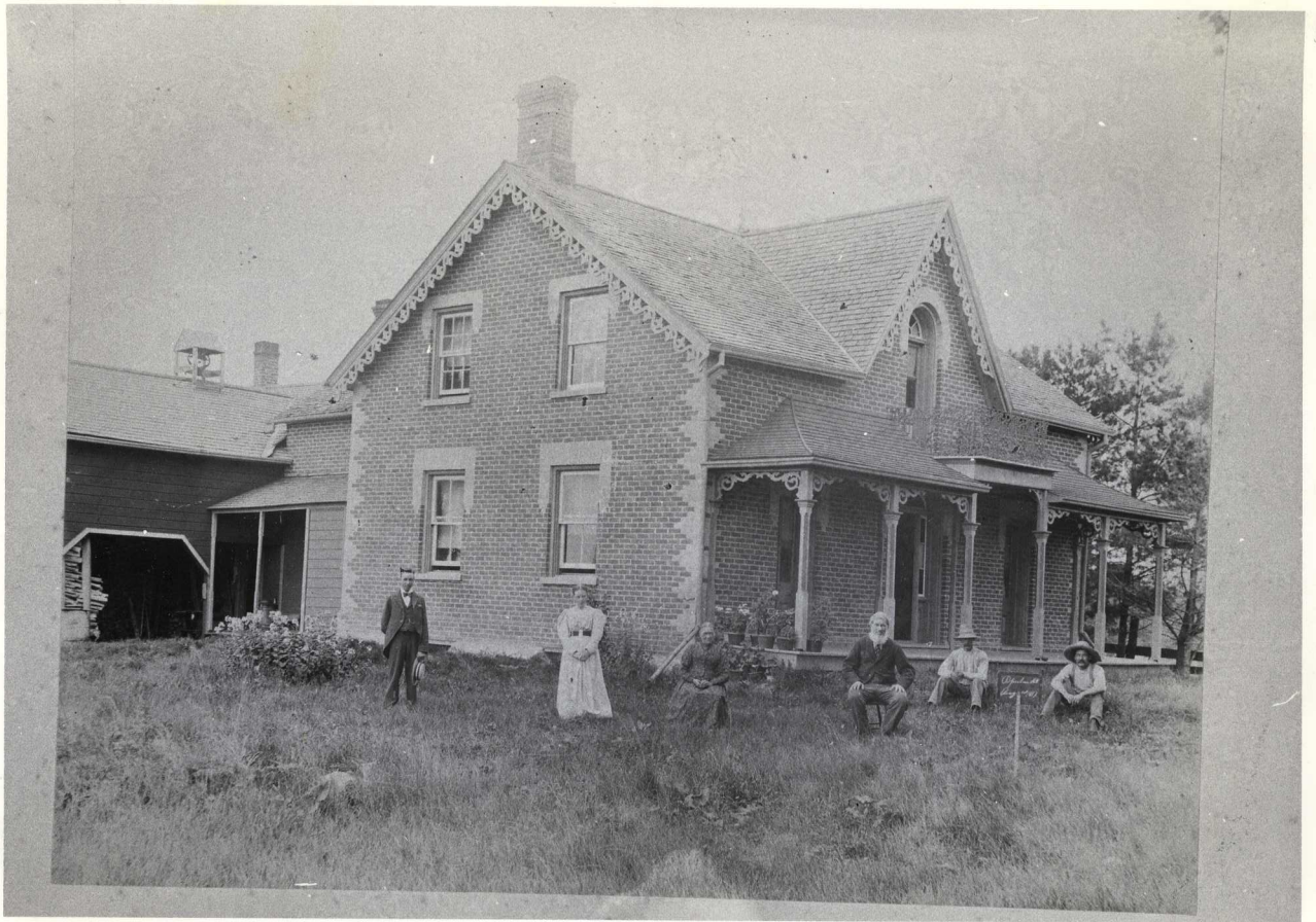
FOREST mactaggart Home