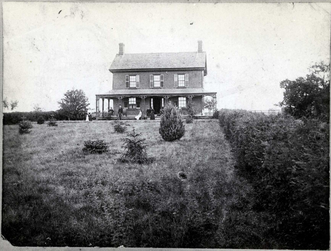
The Irwin Farm Home