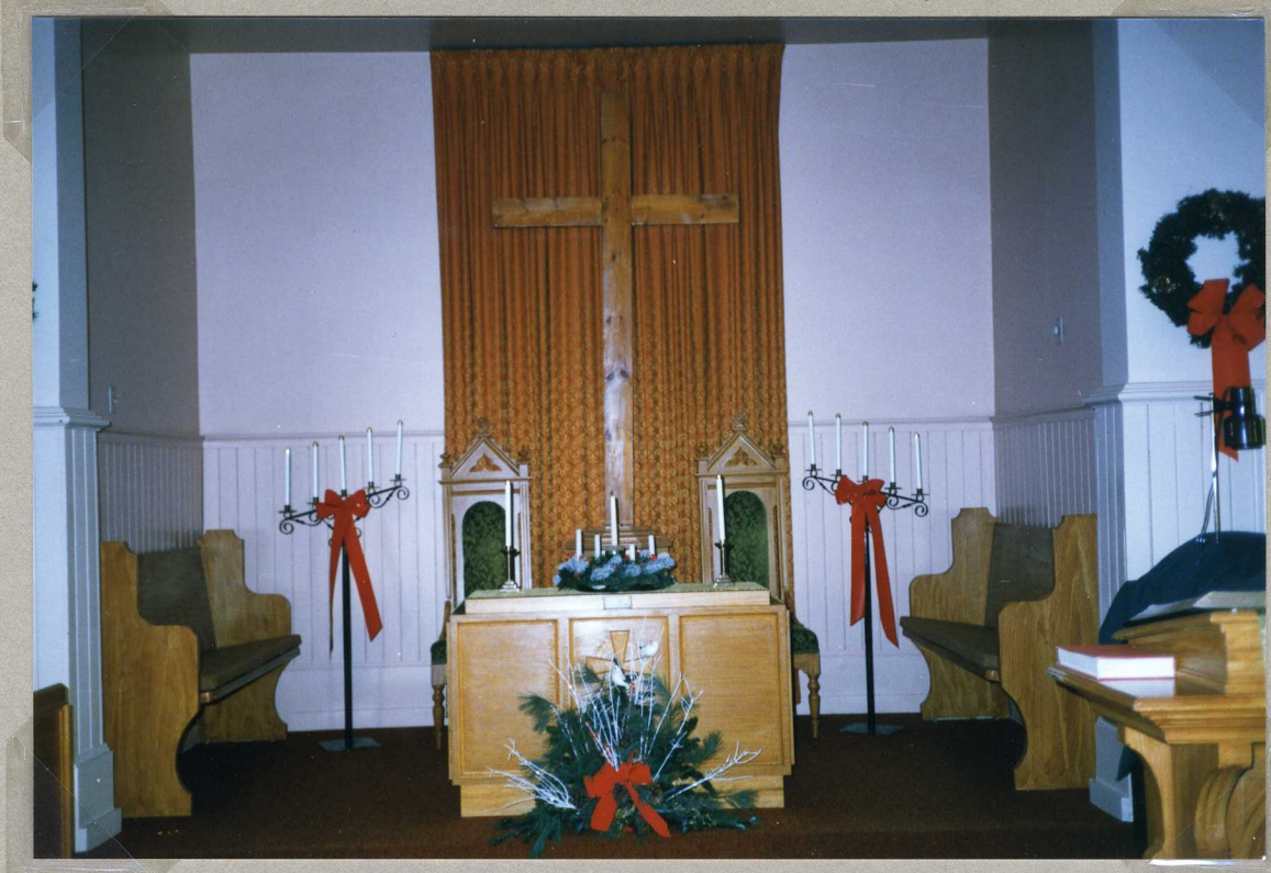
Interior Nobleton United Church