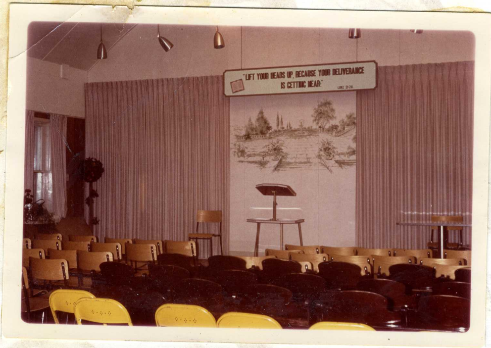
Kingdom Hall interior after renovations