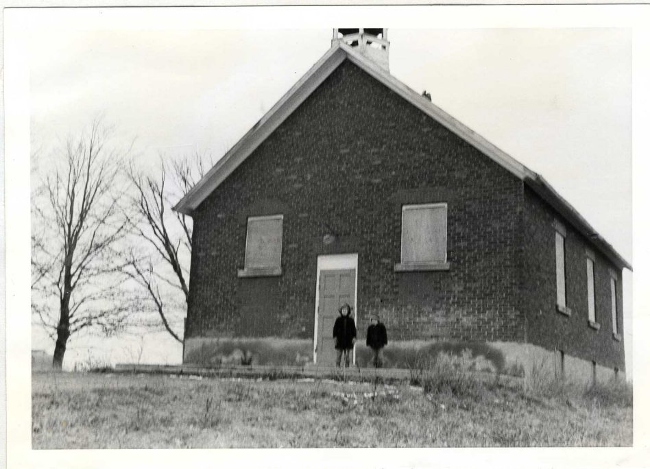
Tenth line school as sold to the Jehovah Witness 1967