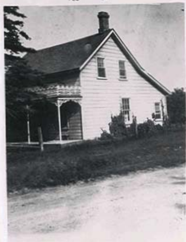
MCDONALD HOUSE N.Y. - CORNER OF KING SIDE RD, AND BATHURST. ST., - TEMPERANCEVILLE