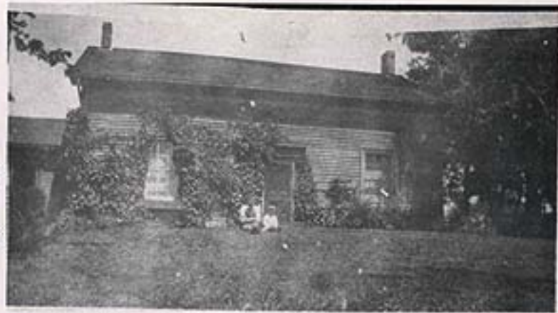
LOT. 2. CON. 2. KING