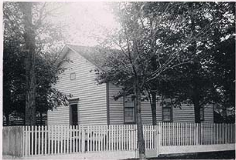
Presbyterian Church. TEMPERANCEVILLE